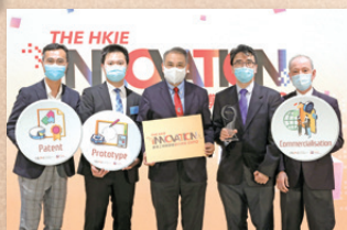
「中醫與科技結合 – 3D 針灸銅人」獲香港工程師 學會頒發 Innovation Award Chinese Medicine Through Technology – 3D Acu-Man awarded by The Hong Kong Institution of Engineers (HKIE) with Innovation Award