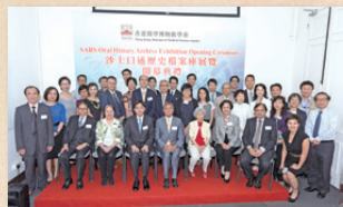
沙士口述歷史檔案庫 展覽開幕典禮 SARS Oral History Archive Exhibition Opening Ceremony