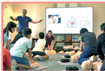
成人及兒童心肺復甦法实操 CPR Hands-on: Adults & Children