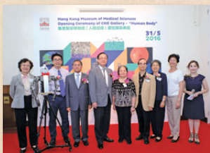
博物館成立 20 周年 「人體結構」展覽開幕 Opening Ceremony of Human Body to celebrate the 20th Anniversary of the opening of the HKMMS