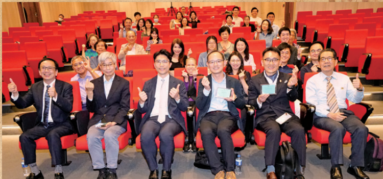
大合照 Group Photo