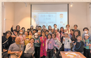
「我是小醫生」四周年， 近一半場次免費為基層學 童啟蒙醫學 4th Anniversary: Little Doctor Workshop offers half its sessions free to underprivileged children