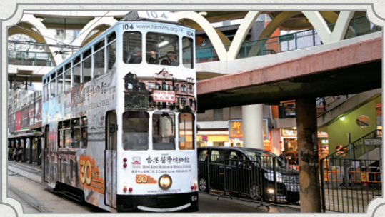
電車穿梭於中環、銅鑼灣街道 The tram passing through Central and Causeway Bay