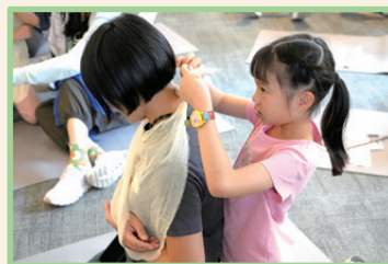
骨折包扎練習 Practicing Fracture Bandaging