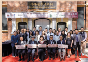
慶祝 30 周年 「現代醫學 II」展覽開幕 Opening Ceremony of Modern Medicine II to celebrate the 30th Anniversary of the opening of the HKMMS