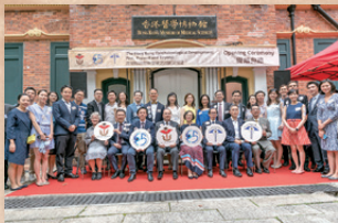
香港眼科醫療發展之回顧 及展望開幕典禮 Opening Ceremony of the Hong Kong Ophthalmological Development: Past, Present and Beyond