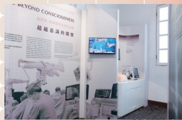
展廳實況 Gallery Interior

This exhibition was made possible by the generous sponsorship and unwavering support of these institutions, allowing the vital history of life-saving medicine to be vividly presented. Focusing on the specialties of anaesthesiology, pain medicine, and intensive care, the showcase highlights the critical roles of anaesthesia and critical care in safeguarding lives through the lens of scientific research and evidence-based analysis.