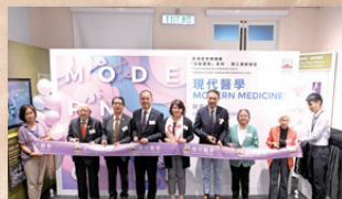
與香港婦產科醫學院合辦的 「現代醫學」展覽開幕 Opening of the exhibition "Modern Medicine" in collaboration with the Hong Kong College of Obstetricians and Gynaecologists

「醫學歷史興趣組」至今已 成功舉辦 30 次聚會，旨在 推動醫學歷史的興趣和研究 Medical History Interest Group – 30 meetings held to date, aiming to promote interest and research in medical history